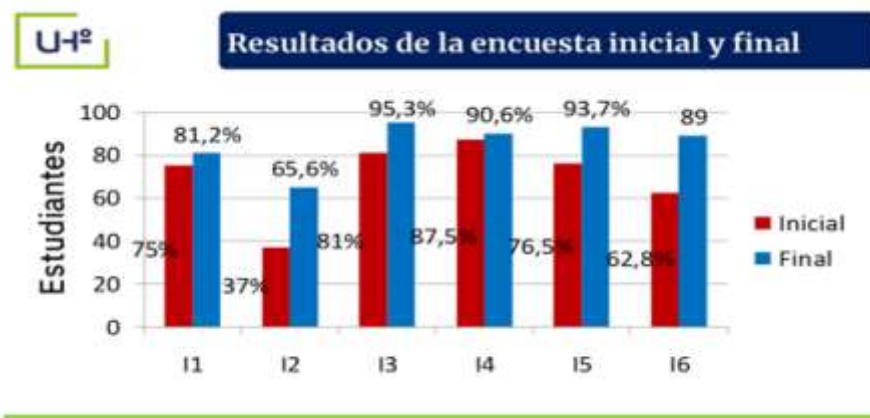
Fig. 3. - Tabulation of the initial and final survey of students

On the other hand, the results of the final survey carried out on the students showed an improvement related to the vocation, professional interests, the goals set and the immediate professional objectives, in addition to showing greater confidence in the selection of the LCF as they were more familiar with its particularities; which meant a development of the vocation for the Career (Figure 3).