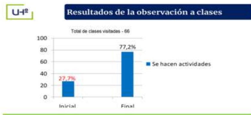
Fig. 2. - Initial and final tabulation of observed training classes and units

Observation of classes and training units after applying the proposal confirmed an increase in the development of activities identified with the LCF compared to the results obtained in the initial characterization (Figure 2).