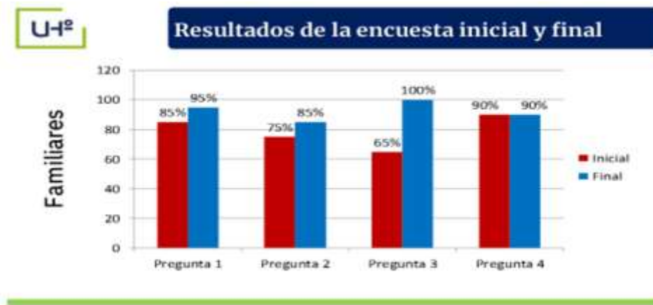
Fig. 5 - Tabulation of the survey of family members of EIDE pre-university students

The final survey administered to family members revealed an improvement in the help from the school to guide their son about the opportunities offered by the Career; they recognize its particularities and social importance, in its four spheres of action; they propose to know the activities that the school develops with the aim of promoting their children's vocation, motivation and interest in it and the majority of those surveyed recognized the importance and need to train teachers in the four spheres of action of Physical Culture (Figure 5).