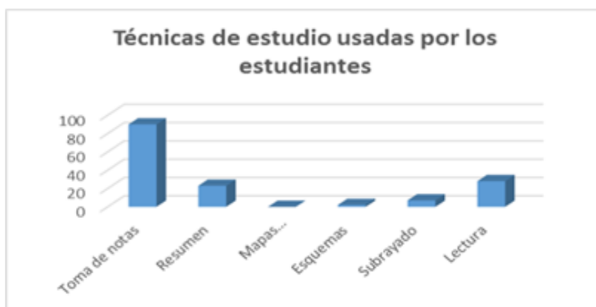
Fig. 3. - Results of the student survey

In the survey, students reported that they do not know how to use study techniques (Figure 3).