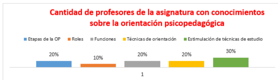
Fig. 1 - Results of the group interview with teachers of the subject basic Spanish

The characterization of the process of psycho-pedagogical orientation in the basic Spanish subject in the Physical Culture career of the CPE in "Hermanos Saiz Montes de Oca" University of Pinar del Río is presented from the behavior of each instrument applied. During the interview to teachers about the knowledge about the process of psychopedagogical orientation in a general way they do not know the particularities (Figure 1).