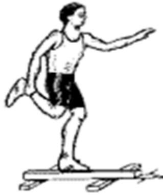
Fig. 1 - Postural graphic of the flamenco balance

The test is based on counting the number of rehearsals the performer has needed to achieve balance for one minute.