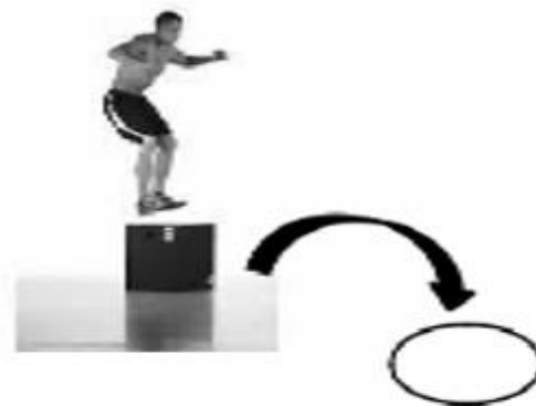
Fig. 3 - Postural graph of balance in flight

Description: the subject must stand on the Swedish drawer, at the edge of it, jump and in the air turn around to fall into the circle, in a balanced condition, facing the drawer. The score given is ten points for whoever falls in balance conditions, with his feet placed in the line parallel to the drawer. If you fall at 45 degrees or more from the parallel, but in balance conditions, seven points. If you fall in an unbalanced condition, outside the circle, four points. And if he rests his hands on the floor, two points.